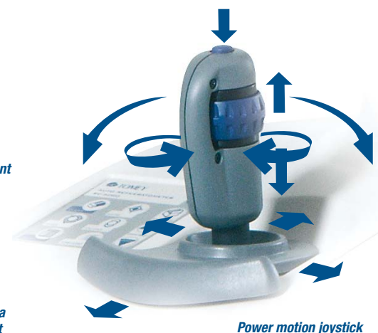
Power motion joystick

2012/04 - subject to change without notice