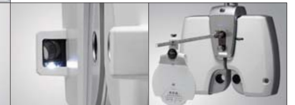
Illumination / Detachable Near Chart Rod