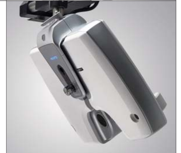
Tilttable Refractor Body