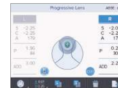
Progressive Lens Measurement

Measurement data can be shown on display with QR code.