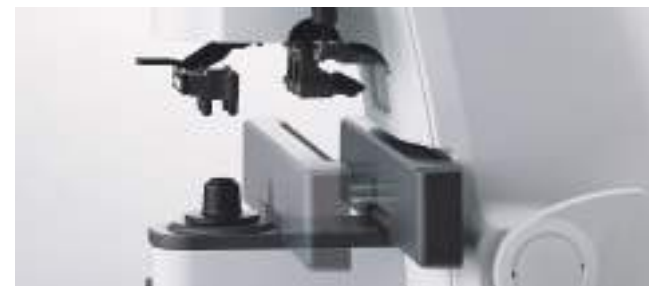
Minimize the Distance between PD Bar and Lens Support

CLM-1 can check transmission rate for 4 wavelength 395nm(UV),415nm(Blue - Low), 460nm(Blue - High),545nm(Green).