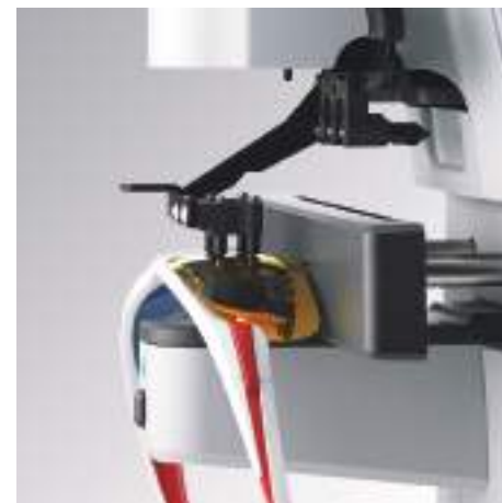
Mirror Lens Measurement

While measuring the refractive power of darkly-tinted or mirrored sunglasses, the CLM-1 will calculate the refractive power of the lens by automatically amplifying the amount of light without requiring any additional key strokes, the same way it measures normal lenses.